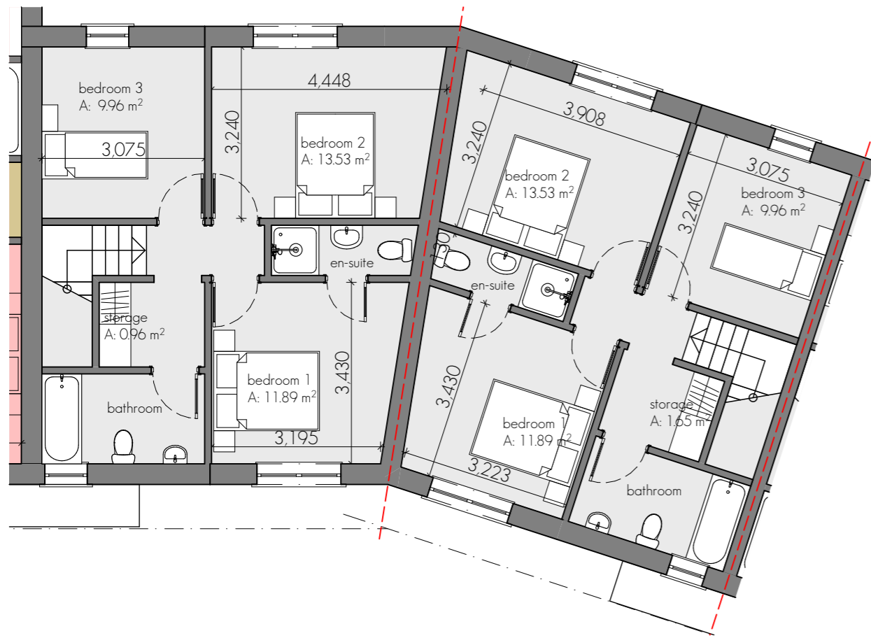
FIRST FLOOR 1:100

THIS DRAWING IS FOR PLANNING PERMISSION PURPOSES ONLY. FURTHER DRAWINGS AND STUDIES WILL BE REQUIRED FOR CONSTRUCTION AND TO ENSURE COMPLIANCE WITH RELEVANT BUILDING REGULATIONS AND STANDARDS. NOTE: PLEASE REFER TO THE SITE LAYOUT DRAWING FOR ALL FFLS AND THE NORTH POINT ORIENTATION